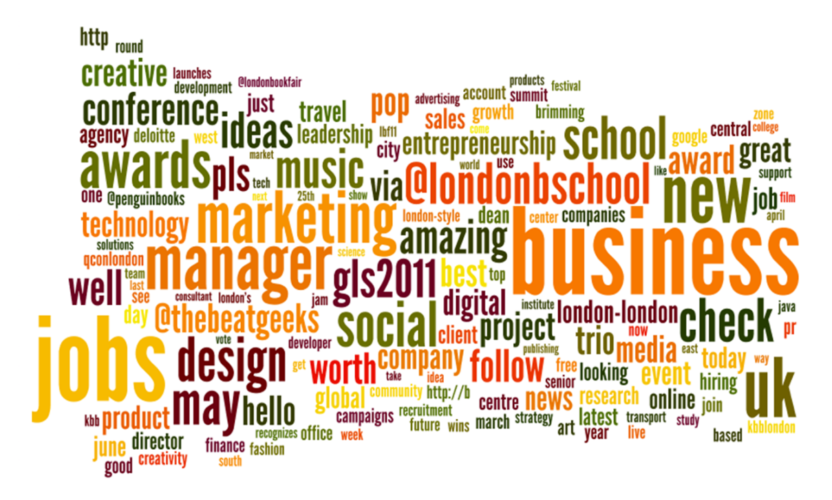
Figure 1. Wordle word cloud of Tweets about Innovation/Innovative of London.

Business, marketing and jobs are frequently mentioned words when people talk about innovation in London. "Conference", "summit" and hashtags with abbreviation names of the events was the main driver for the conversations in these 12 weeks.