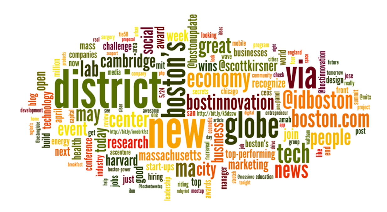
Figure 3. Wordle word cloud of Tweets about Innovation/Innovative of Boston.

The word cloud of Boston innovation Tweets also shows words reflecting a business orientation - economy, technology, marketing, etc. In contrast to New York or London, the Boston tag cloud includes many composite words with "boston" within them, such as "bostonredevelop", "@idboston", "boston.com", "@bostonupdate", "bostontweet", "bostinnovation". Most of these hashtags are related either to large organizations or to Boston local press. People are consciously Tweeting about innovation-related events in the Boston area.